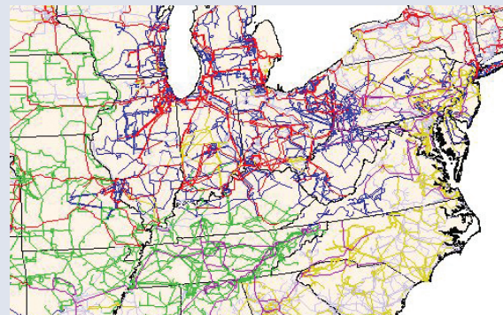
A very large transmission system simulated with ePHASORSim